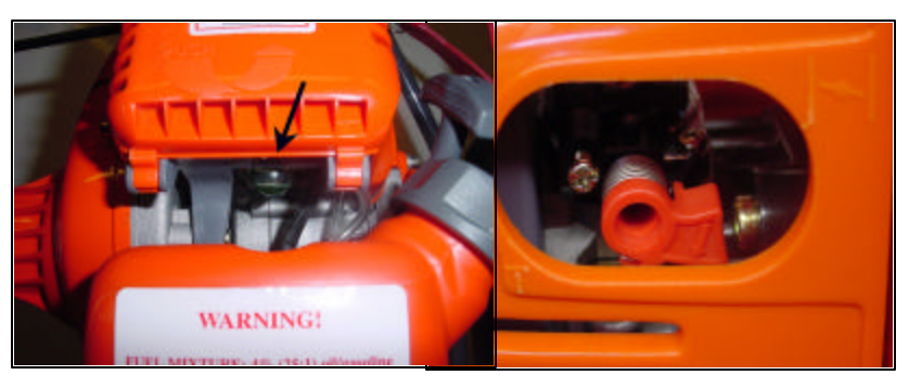
FIG. 5 FIG. 6

Fill the carburetor by pushing primer bulb (fig 5). Put the choke lever in the closed position (fig 6). Pull the starting rope slowly until you meet resistance, then pull it hard until engine starts.